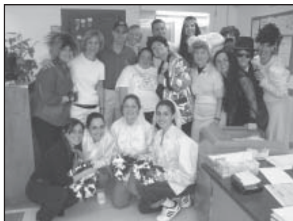
Team Spirit in Action

We continually look for activities to add to interest different groups of our students. This is another evolving program. Our sports competitions for points take place during our physical education classes. A special assembly held on the second to last day of Team Spirit has teams with teachers competing against each other in basketball. There are no regular classes on the last day of